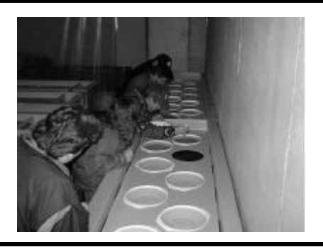
Said one fish to another, "Making little fishies is no fun anymore!"

The river could have been opened this year, but as another contribution to the river's future and as a show of support for that future, Miawpukek Mi'kamawey Mawi'omi, put off it's food fishery for another year and requested that the river remain closed for another year.