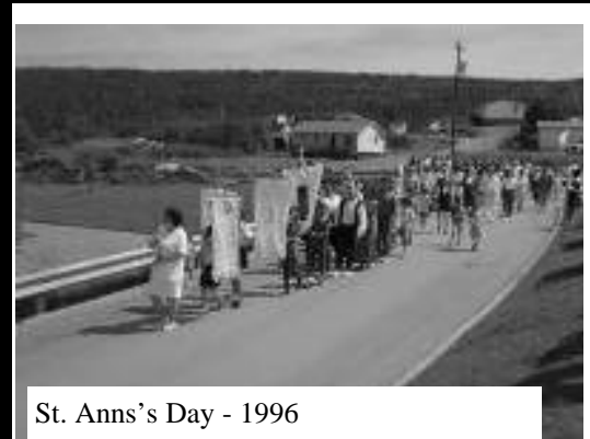
St. Ann's Day - 1996