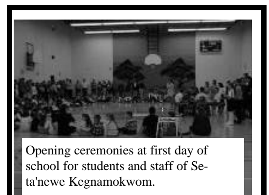
Opening ceremonies at first day of school for students and staff of Se-ta'newe Kegnamokwom.