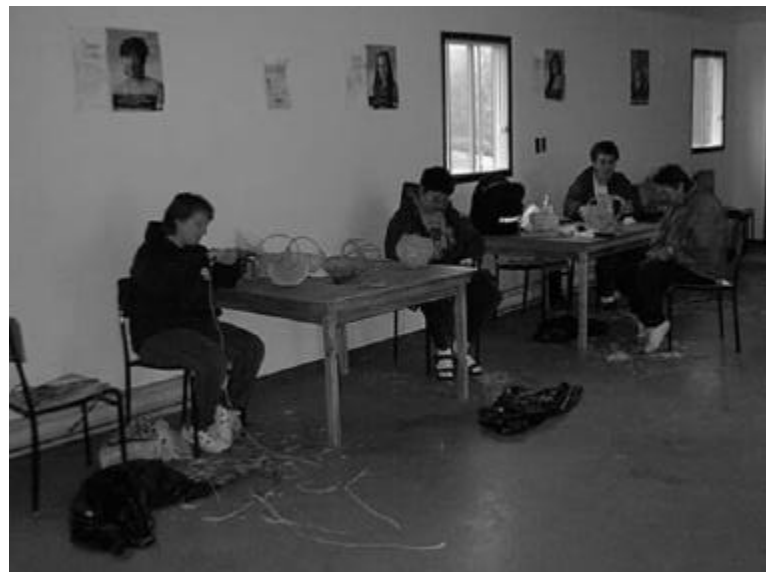
Traditional Basket Makers