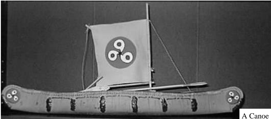
A Canoe and two Canoe Makers