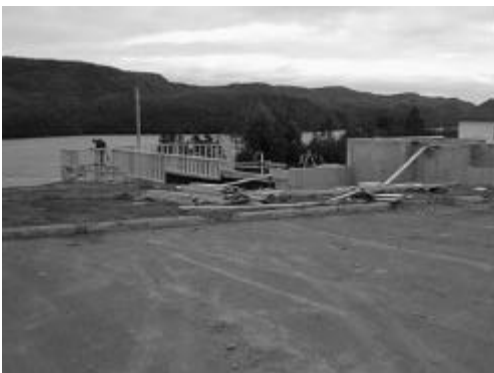
The new church will be up and wawertight by this fall.